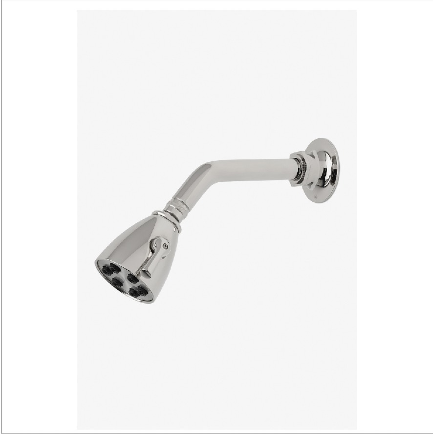
SHOWN IN HENRY 2 3/4" SHOWERHEAD WITH ADJUSTABLE SPRAY WITH 8" WALL MOUNTED 45 DEGREE SHOWER ARM | HNS335

Henry 2 3/4" Showerhead with Adjustable Spray with 8" Wall Mounted 45 Degree Shower Arm