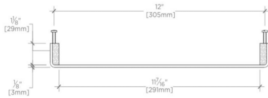
TOP VIEW SCALE: 3"=1'-0"