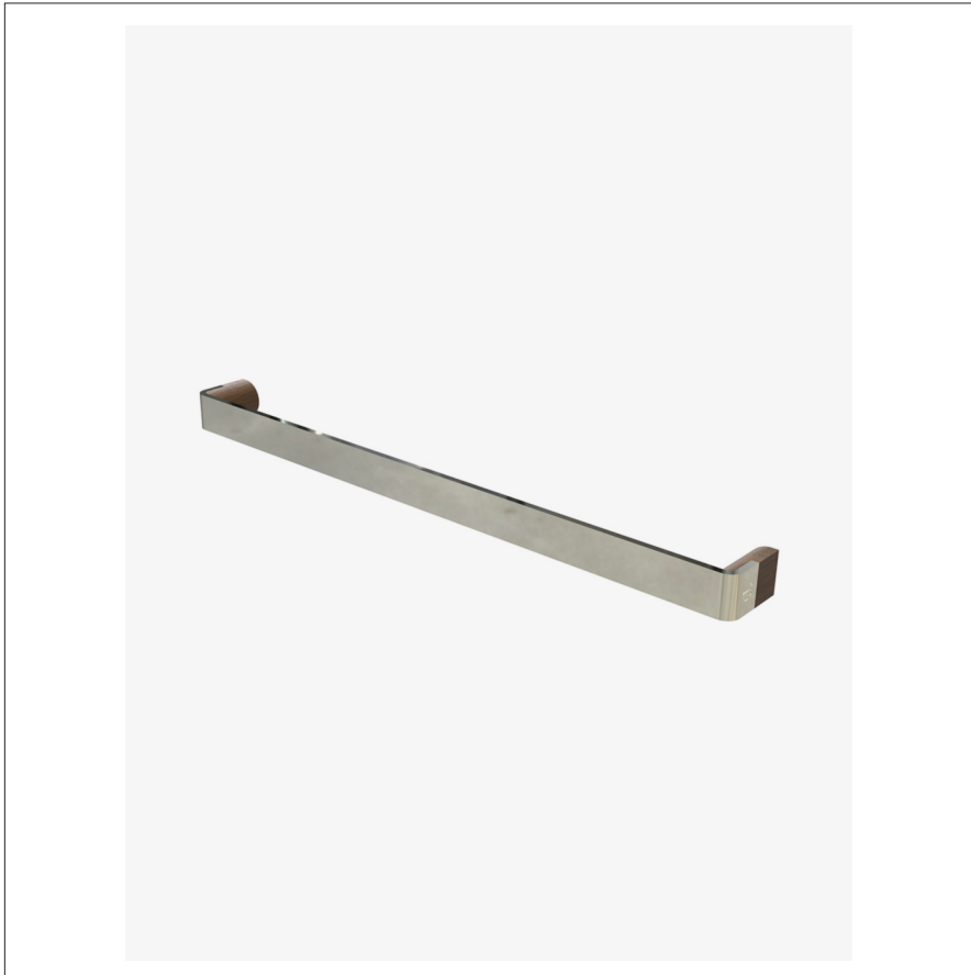
SHOWN IN MUIR 12" METAL AND WALNUT PULL | MUHW12