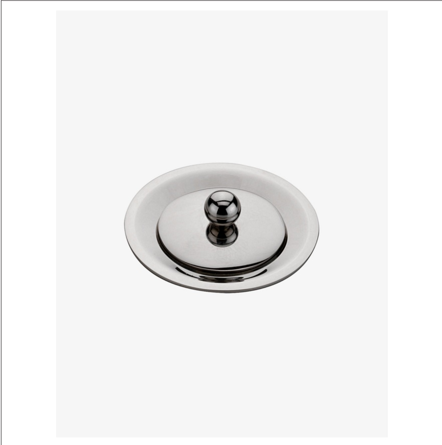
SHOWN IN UNIVERSAL EURO STYLE LIFT AND TURN LAVATORY DRAIN WITHOUT OVERFLOW| UNLD01

Universal Euro Style Lift and Turn Lavatory Drain with Overflow