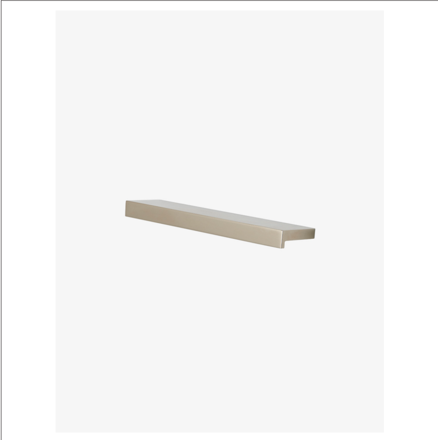
SHOWN IN APEX 6" PULL | AXHW06