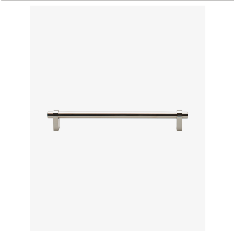
SHOWN IN PINNACLE 10" PULL | PAHW10