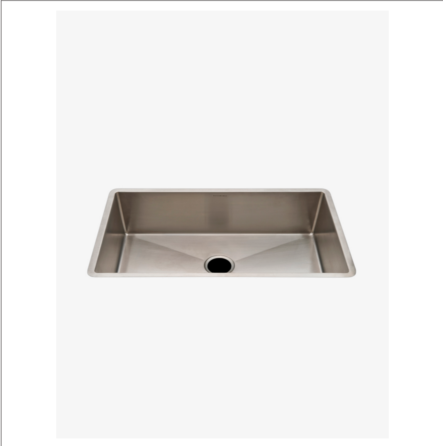
SHOWN IN KERR 39 1/4" X 18 3/4" X 10" STAINLESS STEEL KITCHEN SINK WITH CENTER DRAIN| KRSK16

Kerr 39 1/4" x 18 3/4" x 10" Stainless Steel Kitchen Sink with Center Drain