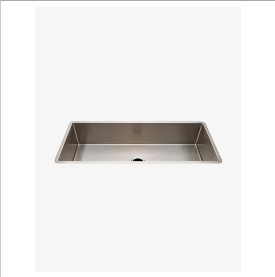
SHOWN IN KERR 45 1/4" X 18 3/4" X 10" STAINLESS STEEL KITCHEN SINK WITH CENTER DRAIN | KRSK18

Kerr 45 1/4" x 18 3/4" x 10" Stainless Steel Kitchen Sink with Center Drain