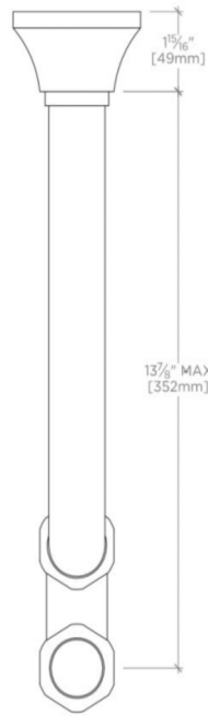
TOP VIEW SCALE: 3"=1'-0"

Universal Standard P-Trap 1 1/2" x 1 1/2"