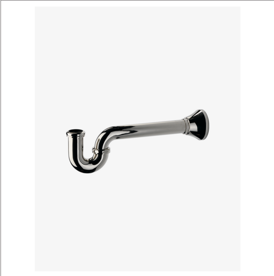
SHOWN IN UNIVERSAL STANDARD P-TRAP 1 1/2" X 1 1/2" UNPT45