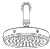
FRONT VIEW SCALE: 1/2"=1'-0"