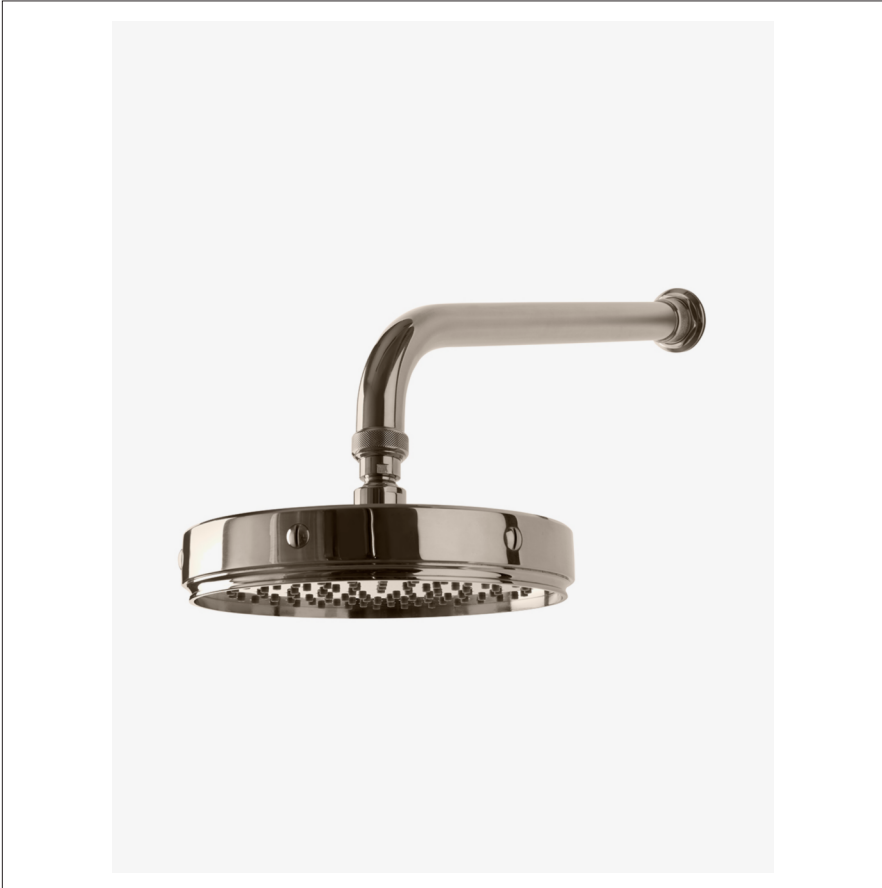
SHOWN IN R.W. ATLAS 8 1/2" SHOWER HEAD, ARM AND FLANGE | RWSH01