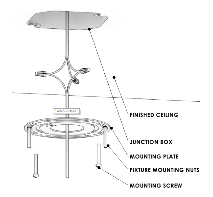
FIGURE - 01