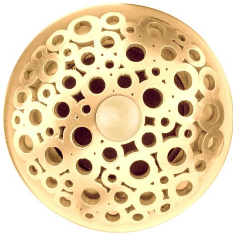
Shown in "SSB-SCR01"

Linkasink warranties our product to be free from manufacturing defect for the life of the product. Warranty does not cover improper care, neglect, abuse or normal wear-and-tear.