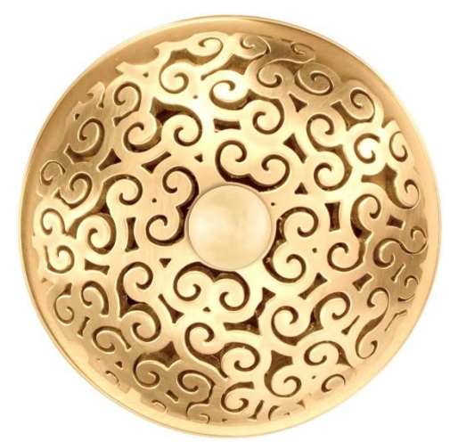
Shown in "SSB-SCR01"