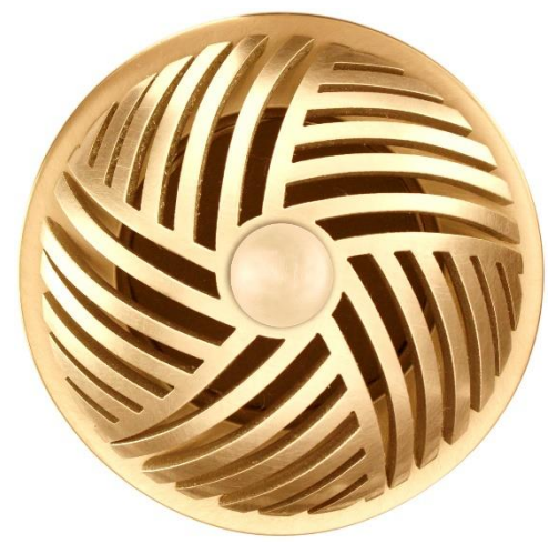
Shown in "SSB-SCR01"