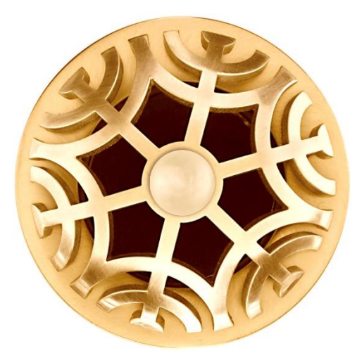
Shown in "SSB-SCR01"