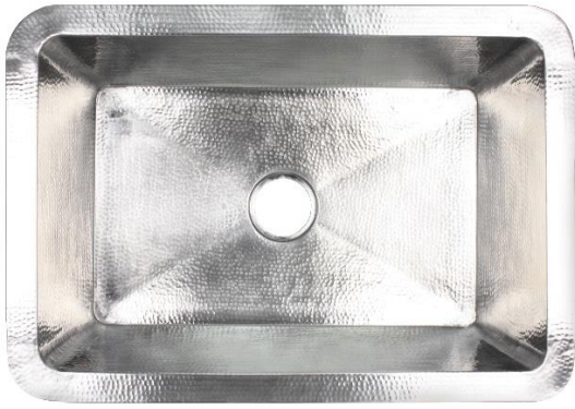
Shown in SS