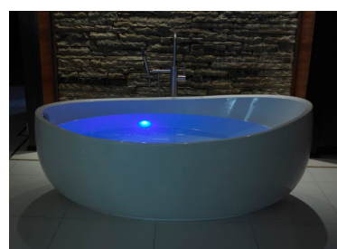
Chromatherapy-LED Lighting System