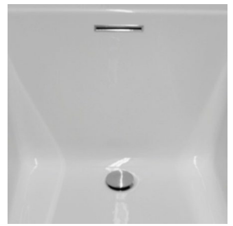
Linear Integral Waste and Overflow