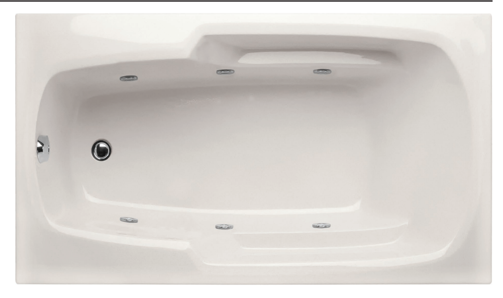
*Tub must be set in mortar base*